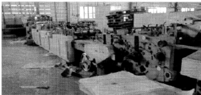
SUGANO FOLDER MACHINE GM 1000

Complete with feeder and delivery unit, Compressor, Transformer and other standard accessories.