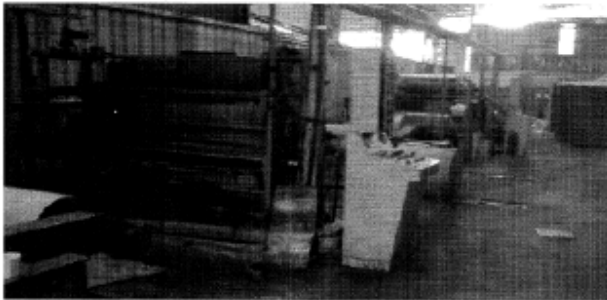
CORRUGATED MAKING MACHINES 30G MODEL

Complete with: Feeder and Delivery unit, Compressor, Transformer And other standard accessories