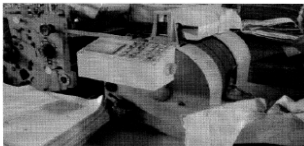
JIAN SHE FEEDING SQUARE BOTTOM PAPER BAG MACHINE

Comprised with: Paper feeder, Gluer, press Compressors, Delivery Unit, Circuit Panel & Controls